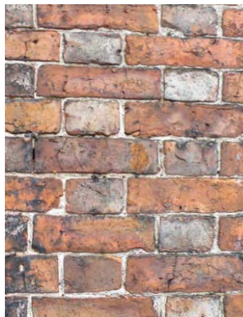
Distinctive chequerboard brickwork is a feature of many buildings in the area.