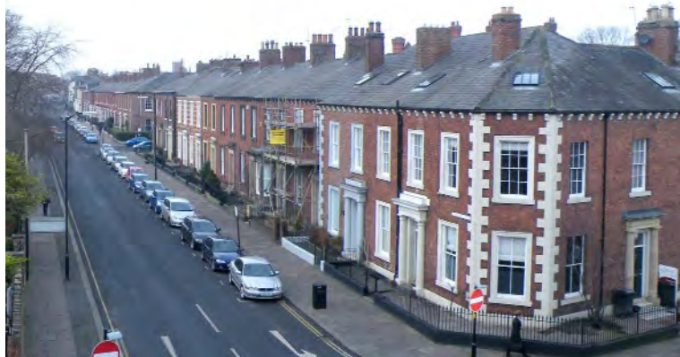
Chiswick Street - Grade II listed buildings within the heart of the Conservation Area.