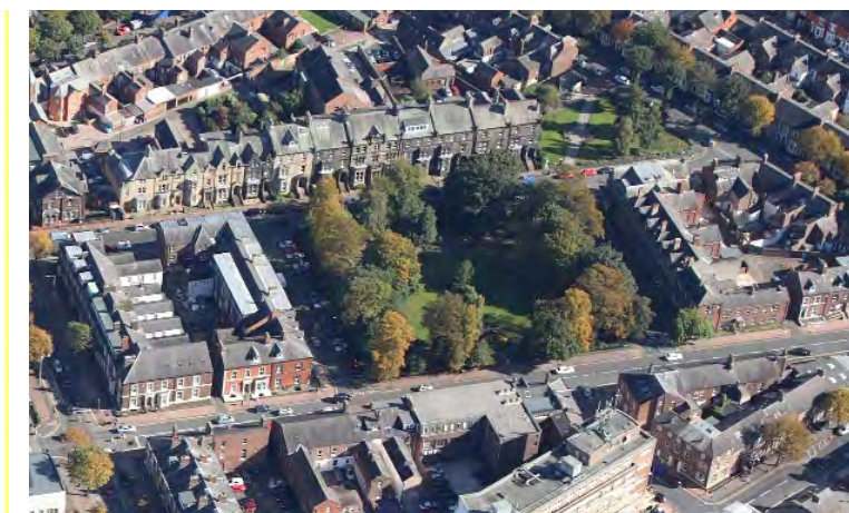
Portland Square - One of the high quality landscaped squares which are key features of the area.

townscape, being made up of clearly defined perimeter blocks, with formal housing fronting all thoroughfares. These blocks are serviced by alleyways/lanes which also have their own distinctive character.