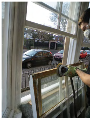
Repair and draft stripping of sash windows.

Repairs do not generally need planning permission unless they include alterations which significantly change the external appearance of the building or structure. Repairs should usually be carried out on a like for like basis to preserve the special character of the building and wider area. If a building is listed consent is usually required for anything other than like for like repairs, both internally and externally.