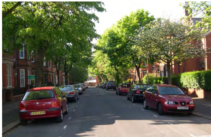
Lismore Place - The quality of the street is enhanced by its legacy of substantial Victorian street trees.