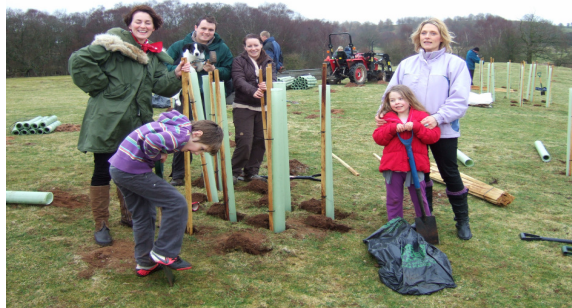
A Family Hard at Work Tree Planting in March

Grant Scheme for funding for the rest of the work and this has now been approved and we plan to plant a further 8,000 trees early this winter in the adjoining fields behind sluice wood and through to the Talkin Road. The tender for this contract will be going out over the next few weeks.