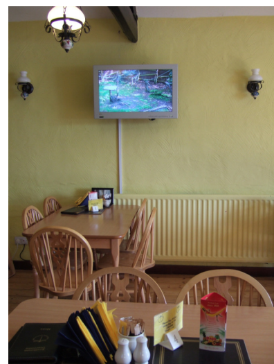
The New Screen in the Tearoom

camera on the Tarn will be able to be live on the web allowing our water sports users to view the weather conditions before setting out from home.