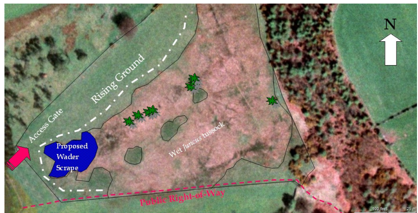
Size and Location of Scrape Within Farlam Field