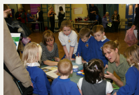
Botcherby community event

A District Forum Event was held at Tullie House on Thursday 20th March. The key note speaker was