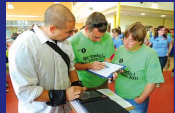
Volunteers for BBC Radio 1's Big Weekend

events, awards ceremonies and launching new volunteering campaigns, hundreds of events take place throughout the country. To find out more, visit www.volunteersweek.org.uk