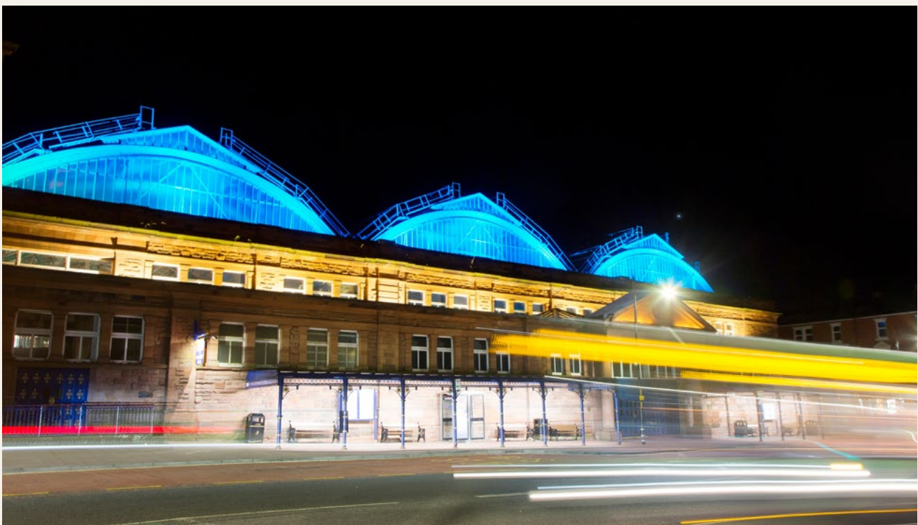
Photo: Lighting-up Carlisle project 2019, the Market Hall, Carlisle