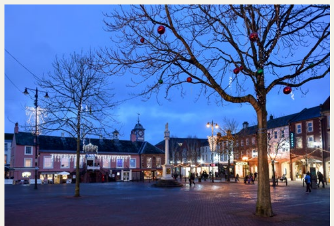
Photo: The Market Square, Carlisle