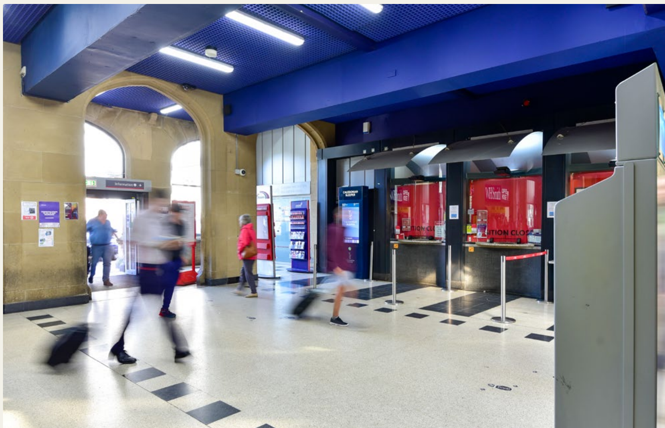
Photo: Carlisle Station