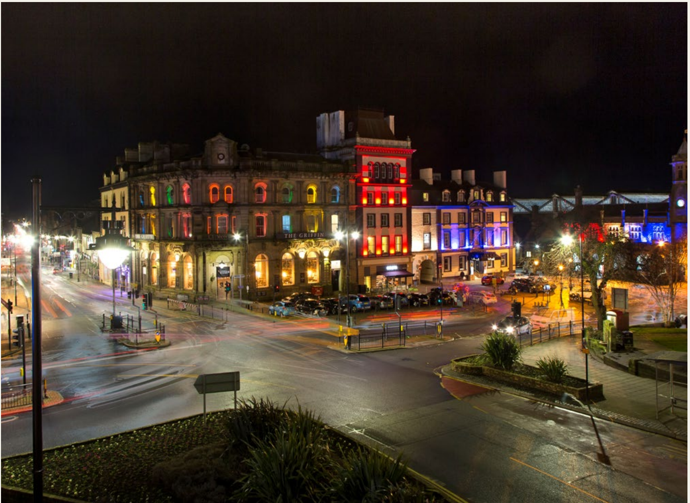
Photo: Lighting-up Carlisle project 2019, Court Square

Carlisle's population will increase through housing-led growth and the delivery of St Cuthbert's Garden Village (SCGV). This will add to the vibrancy and activity in Carlisle City Centre, creating a thriving community for students, residents, businesses, and workers using the City Centre for education, housing, work, and leisure activities, during the day and into the evening. We will also grow Carlisle's visitor economy, attracting additional footfall and spending to the city.