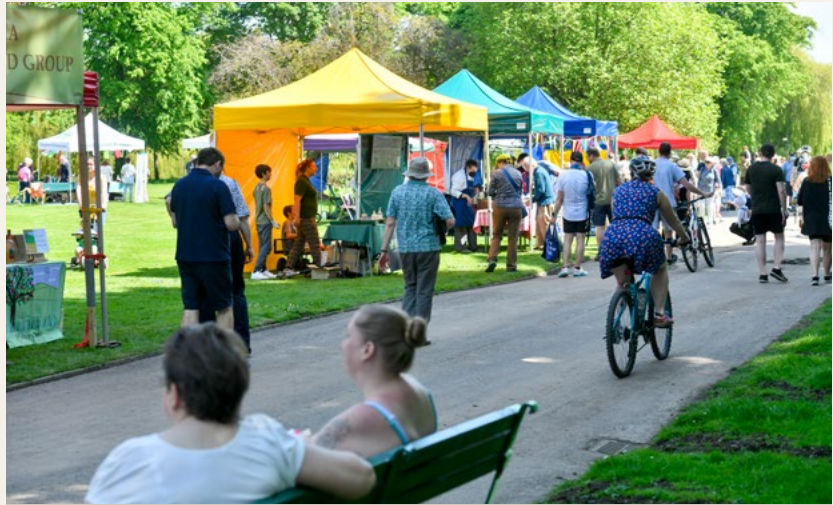
Photo: the Plant, Food and Wellbeing event 2021, Bitts Park

We will work with our partners in the public, health, private and voluntary sectors to deliver a broad programme that will support the good, lifelong health and wellbeing of our residents and visitors. This priority builds on the framework of the Cumbria Public Health Strategy and WHO Healthy City Programme with projects and programmes that will focus on the determinants of health; a sense of place and safety; the quality of the local environment and tackling Climate Change together.