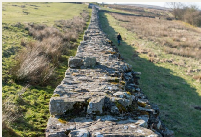
Photos from the top: One of the Citadels; Viewing a digital exhibition; Hadrian's Wall