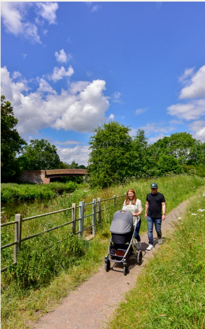
Photo: Public footpath beside the River Petteril

There are challenges ahead that will impact especially on our rural areas due to their ageing population, accessibility and often higher living and infrastructure costs. Knowing these issues and adapting policies and practices to meet the needs of rural areas will be vital to fulfilling the Vision.