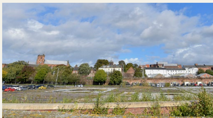
Photo: Caldew Riverside, Carlisle