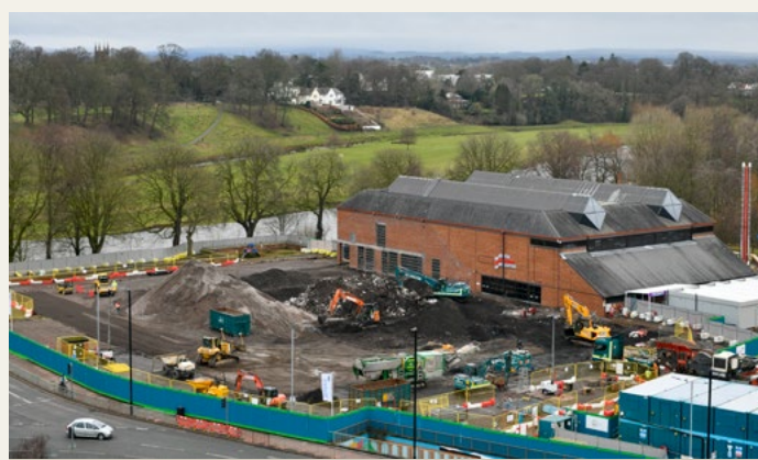
Photo: The Sands Centre re-development in progress