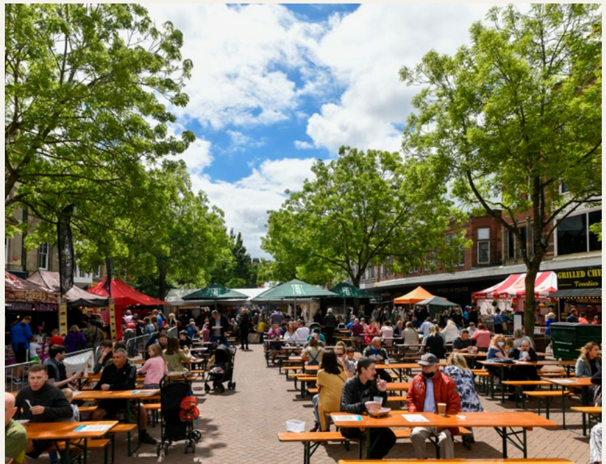
Photo: Hawker Festival 2021

The Covid-19 pandemic has had a significant impact on our local economy. The impact has highlighted the importance of health and wellbeing across all communities reminding us that Carlisle is a place focused on tackling health inequalities and enabling communities to thrive and be healthy. This Plan will help Carlisle to bounce back from this public health emergency, with greater confidence and commitment to meet future challenges.