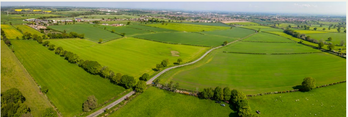
Photo: Land to the south of Carlisle