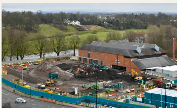
Photo: The Sands Centre re-development in progress