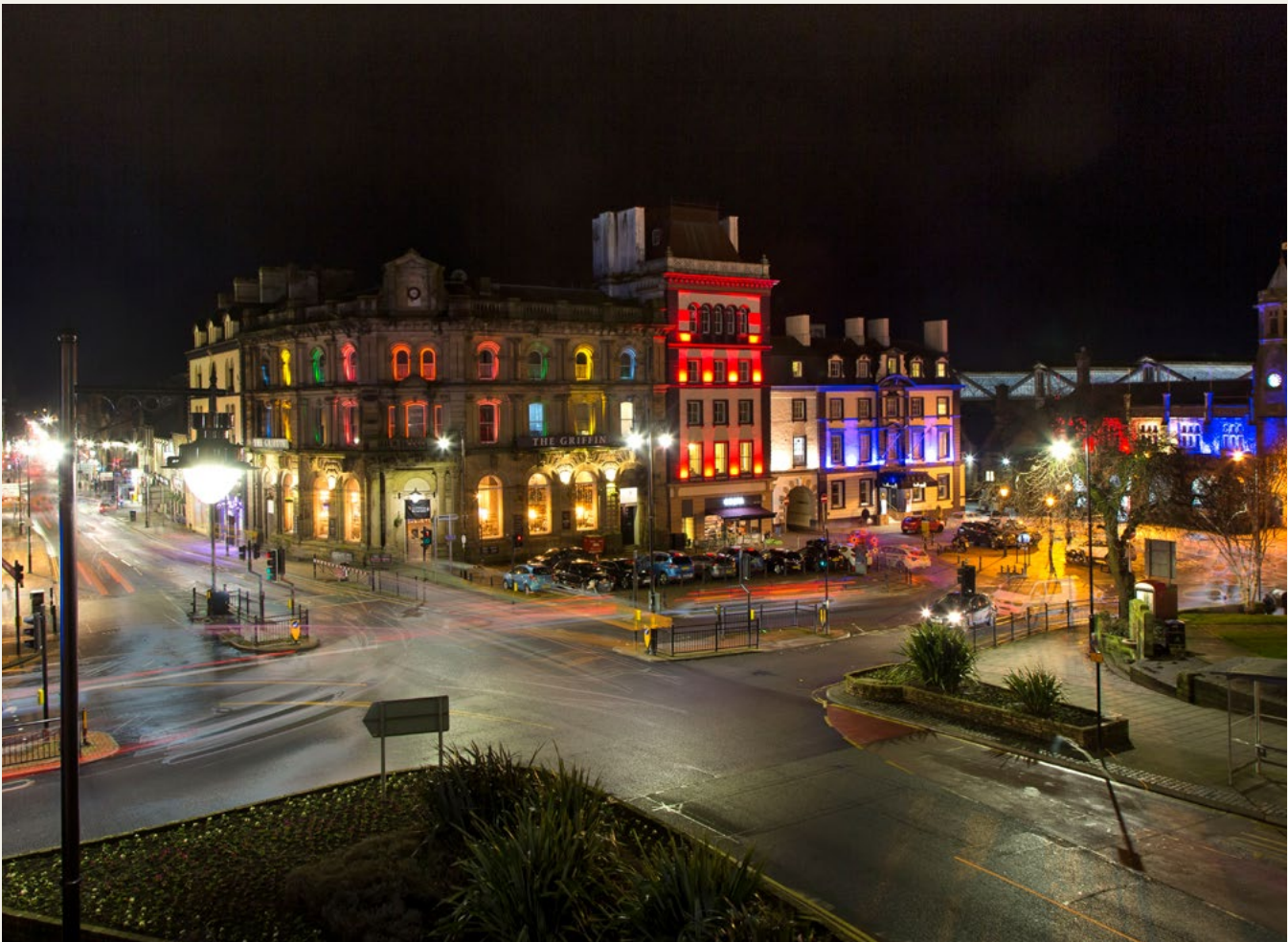
Photo: Lighting-up Carlisle project 2019, Court Square

Carlisle's population will increase through housing-led growth and the delivery of St Cuthbert's Garden Village (SCGV). This will add to the vibrancy and activity in Carlisle City Centre, creating a thriving community for students, residents, businesses, and workers using the City Centre for education, housing, work, and leisure activities, during the day and into the evening. We will also grow Carlisle's visitor economy, attracting additional footfall and spending to the city.