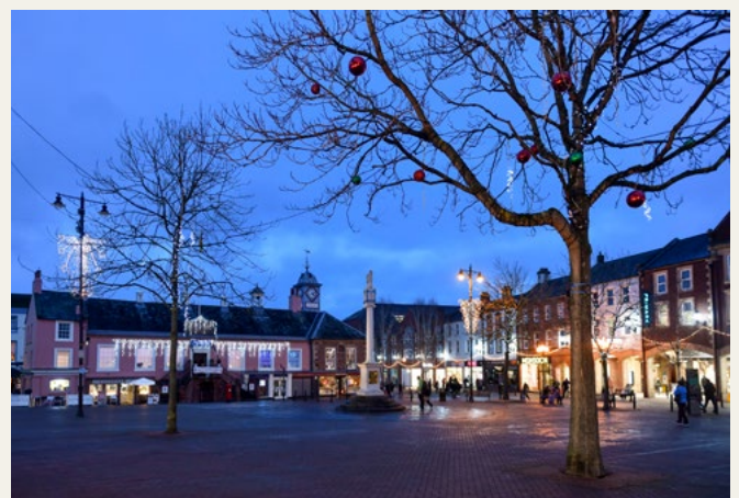
Photo: The Market Square, Carlisle