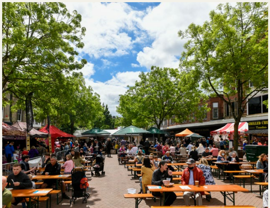
Photo: Hawker Festival 2021

The Covid-19 pandemic has had a significant impact on our local economy. The impact has highlighted the importance of health and wellbeing across all communities reminding us that Carlisle is a place focused on tackling health inequalities and enabling communities to thrive and be healthy. This Plan will help Carlisle to bounce back from this public health emergency, with greater confidence and commitment to meet future challenges.