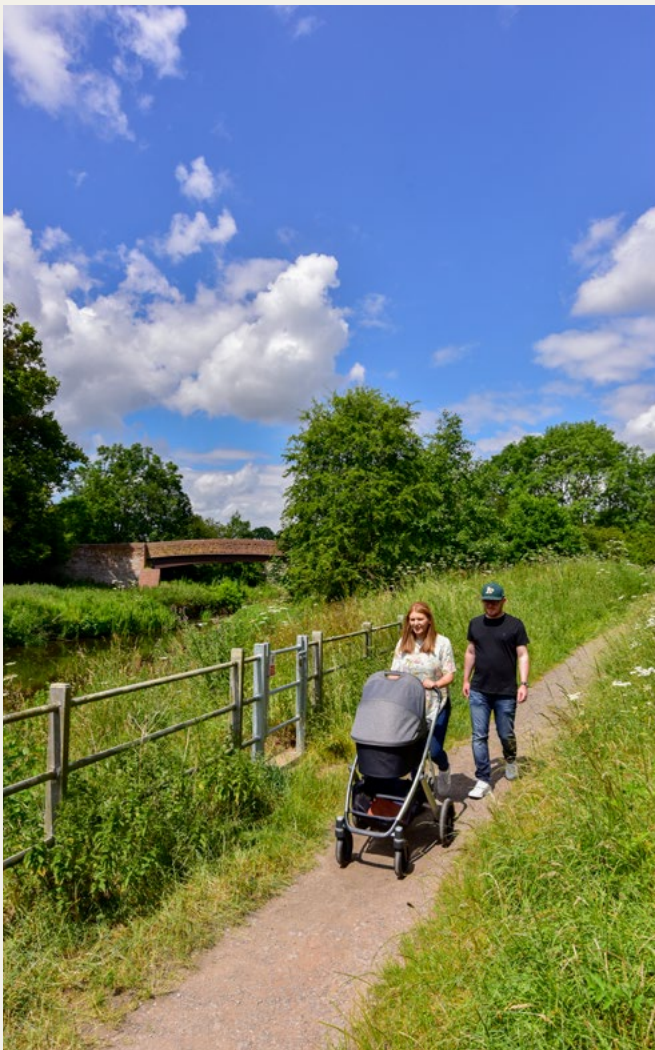
Photo: Public footpath beside the River Petteril

There are challenges ahead that will impact especially on our rural areas due to their ageing population, accessibility and often higher living and infrastructure costs. Knowing these issues and adapting policies and practices to meet the needs of rural areas will be vital to fulfilling the Vision.