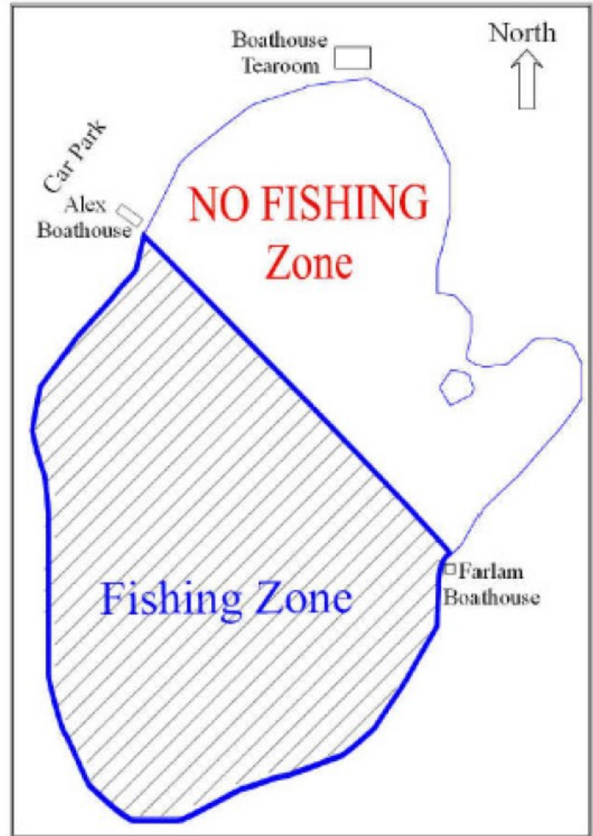
Fishing Zone (Hatched Area) South of a line drawn between Alex Boathouse and Farlam Boathouse