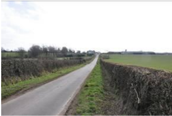
7. View south from the road to Burgh by Sands. Active farmland right of road (see Photo 8.). Land to left, north of settlement boundary slopes towards settlement.