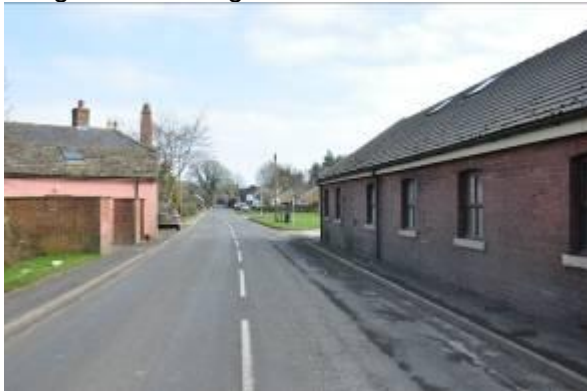
3. View eastwards along B5307 showing narrow footpaths and buildings abutting the long, straight road.