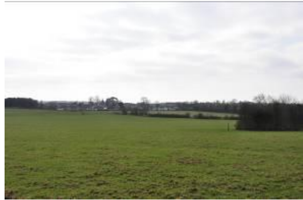
8. View southwest to Kirkbampton in the distance. Active farmland sloping towards Burghmoor Beck