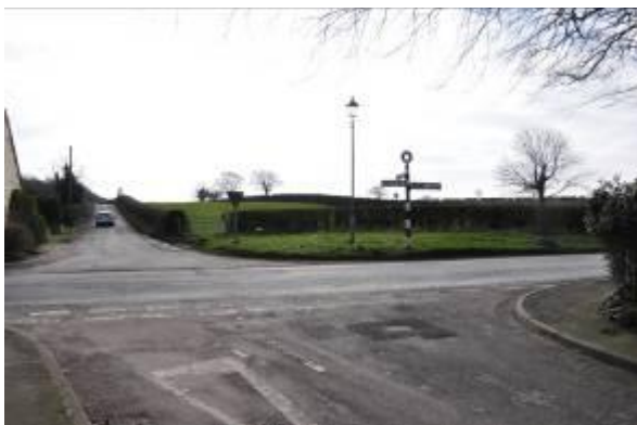
5. View south over junction with B5307 along road to Great Orton. Land rises to the south, restricting long distance views. Well maintained hedges and some mature trees.