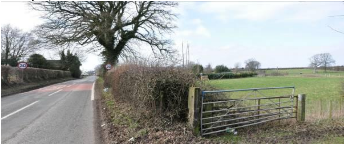
9. Straight approach to village from east along B5307. Lower ground is in floodplain