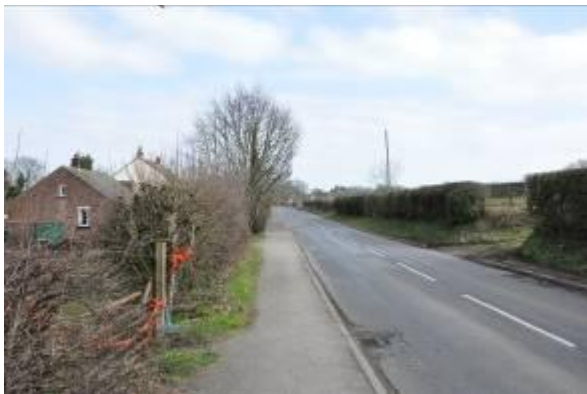
10. Village approach along B5307 from west, near Kirkbampton. Enclosure provided from hedges. Tempting to speed, straight road and little that signals “community” and sense of place.