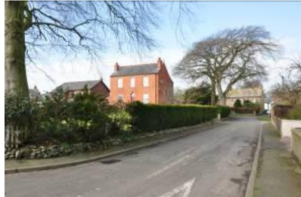
2. View towards the village green from the south at the B5307 junction. Strong access towards village green with character-giving large trees.