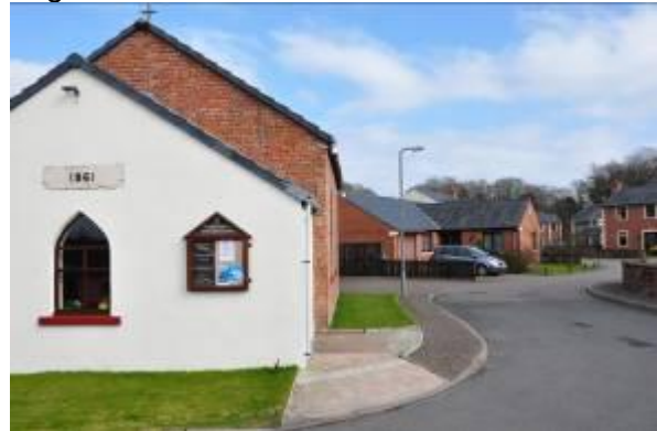
4. Thurstonfield Methodist Chapel, dating back to 1861, with single and 2-storey infill housing behind reflecting materials and character of older parts of the village. Mature trees of SSSI behind.