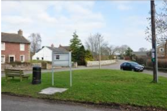
1. The village green looking north east towards the track. The only area of communal public realm in the village. A mix of ages of housing.