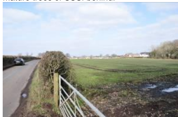
6. View north on road from Great Orton. Edge of settlement visible through gap in hedge in distance with large trees of Thurstonfield Lough SSSI to right.