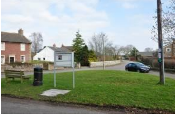
1. The village green looking north east towards the track. The only area of communal public realm in the village. A mix of ages of housing.