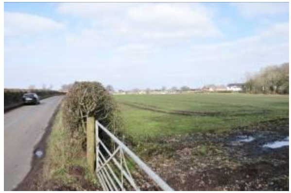
6. View north on road from Great Orton. Edge of settlement visible through gap in hedge in distance with large trees of Thurstonfield Lough SSSI to right.