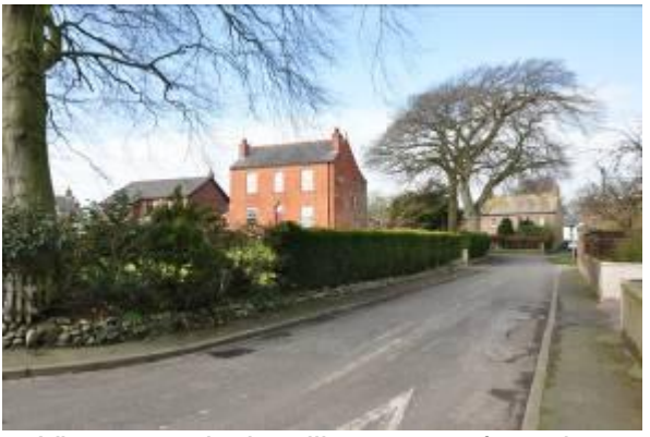
2. View towards the village green from the south at the B5307 junction. Strong access towards village green with character-giving large trees.