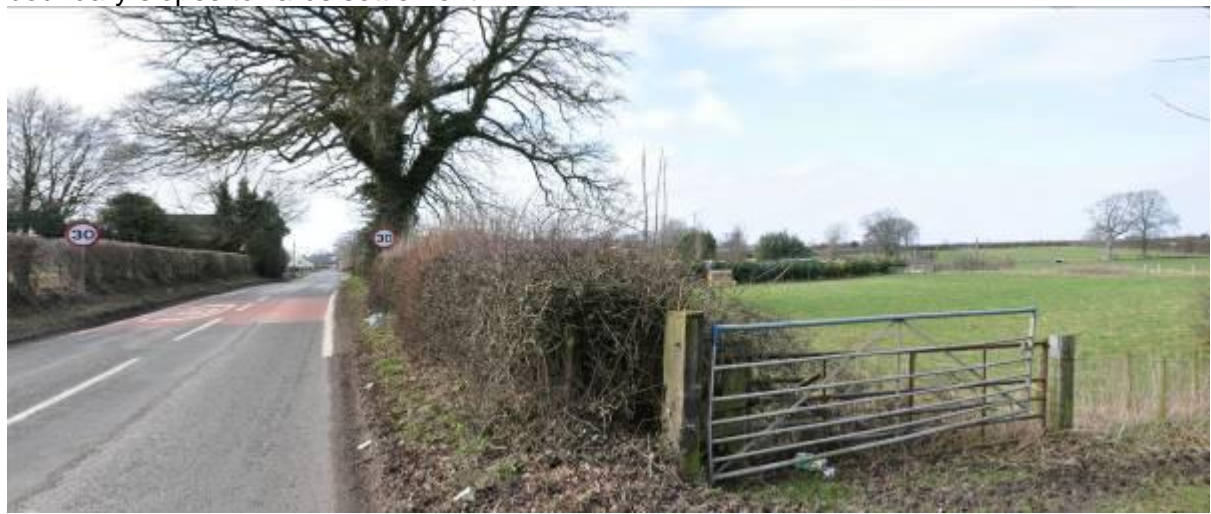
9. Straight approach to village from east along B5307. Lower ground is in floodplain