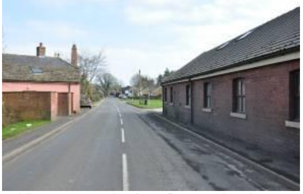
3. View eastwards along B5307 showing narrow footpaths and buildings abutting the long, straight road.