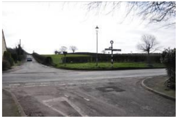
5. View south over junction with B5307 along road to Great Orton. Land rises to the south, restricting long distance views. Well maintained hedges and some mature trees.