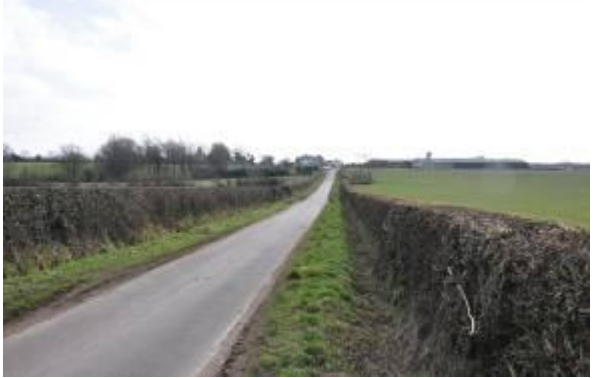
7. View south from the road to Burgh by Sands. Active farmland right of road (see Photo 8.). Land to left, north of settlement boundary slopes towards settlement.