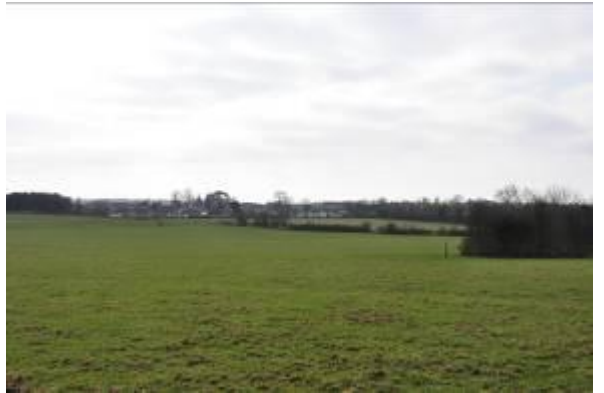
8. View southwest to Kirkbampton in the distance. Active farmland sloping towards Burghmoor Beck