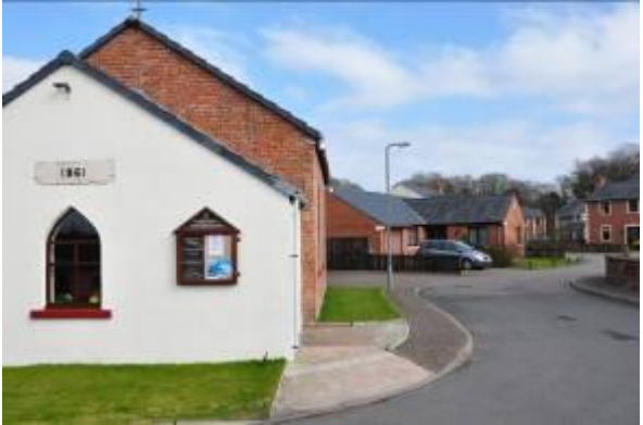
4. Thurstonfield Methodist Chapel, dating back to 1861, with single and 2-storey infill housing behind reflecting materials and character of older parts of the village. Mature trees of SSSI behind.